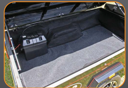
12v battery system