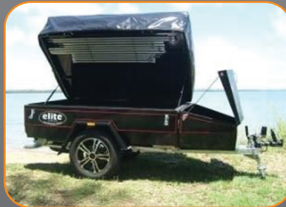
600 litre storage capacity