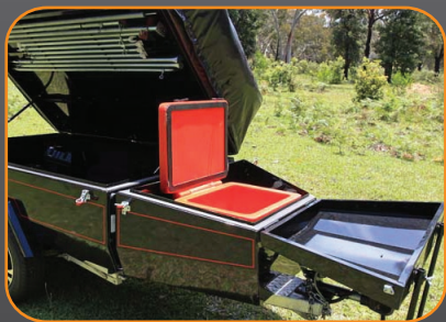
Front Storage Pod with support legs converts to table.