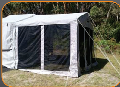
Fully screened sunroom