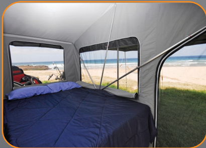
Queen size bed with mattress